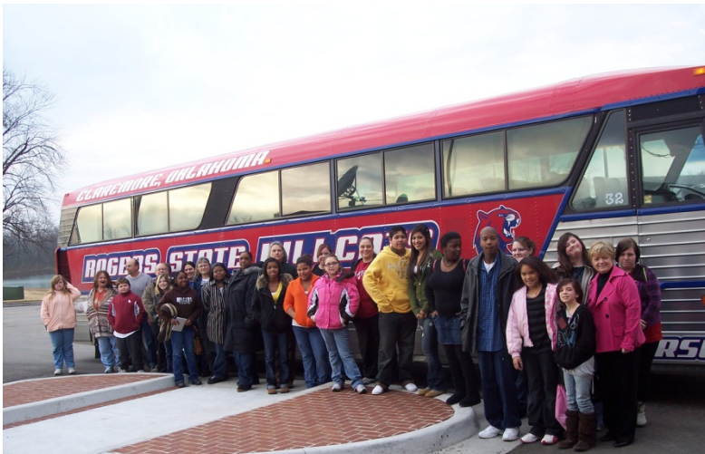
Students, mentors and parents on a recent trip to one of our partner universities, RSU. Students visited the Claremore campus during a school break.