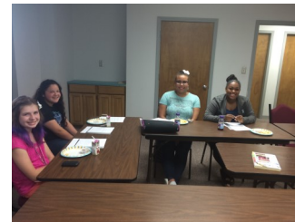
Program Classes (RLRC)