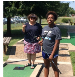
Student Planned Activity